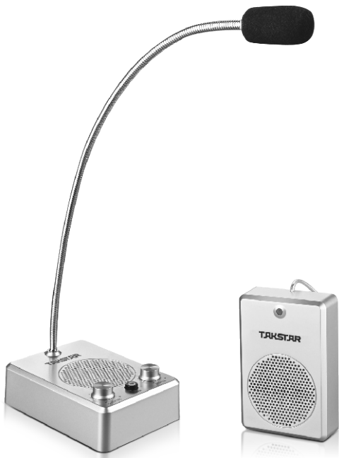
DA-235M Talk-back System